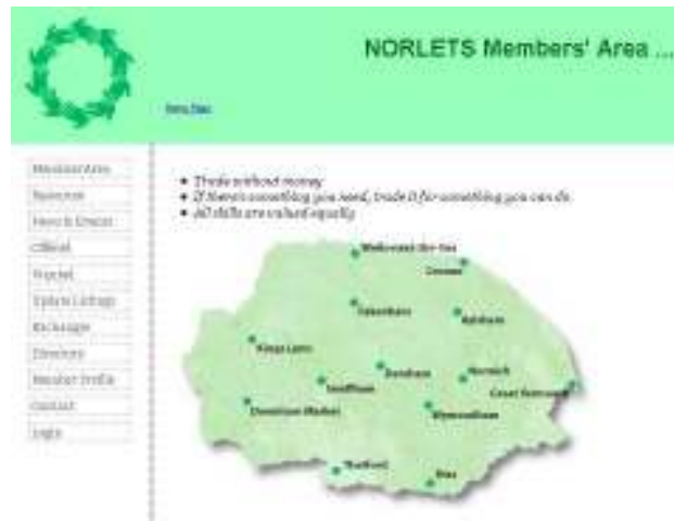
Screen shot of the Norlets web-based administration system.

So, what's next? Well, we're still carefully planning out the transition. The change-over period will probably last about a year, and you can be sure that we'll keep everyone up to date about any interesting developemnts. Watch this space!